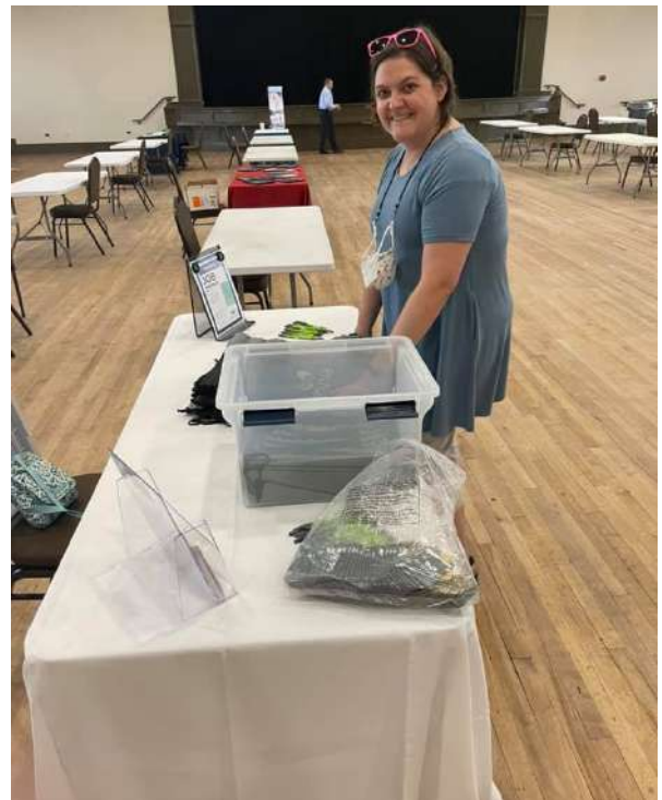
Above and at left: Vendors set up at the job fair in August.