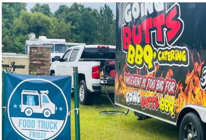
Going Butts BBQ was one of the vendors at Pierce County's first-ever Food Truck Friday last month.